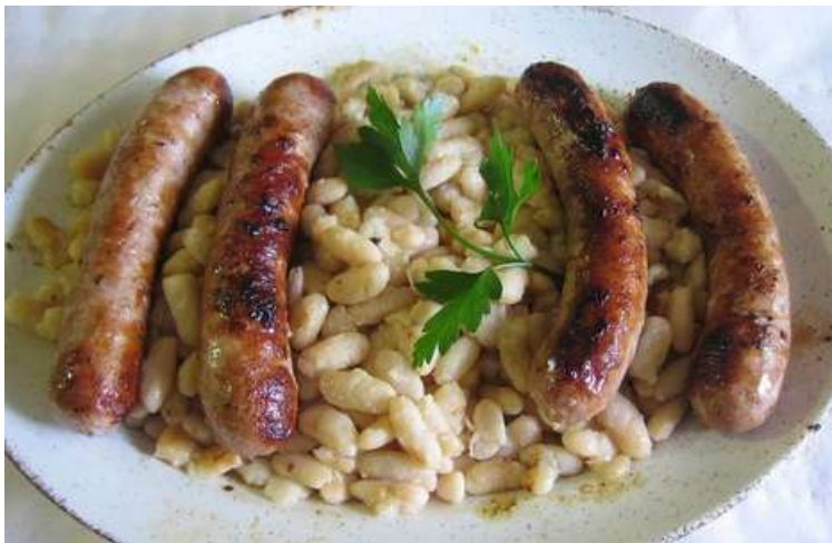
Botifarra amb mongetes