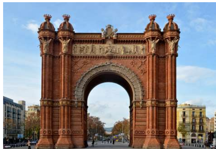
Arc de Triomf