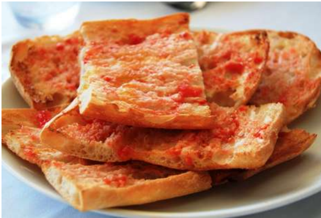
Pa amb tomàquet