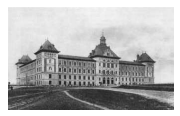
Boku Gregor-Mendel-Haus, 1896