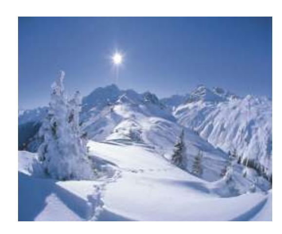
Winter in the mountains